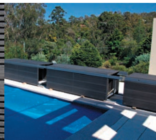
System supplied in 0.8m and 1.6m modules