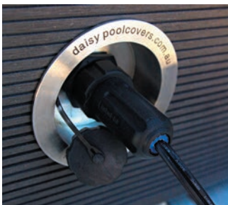
Low voltage mains charging optional