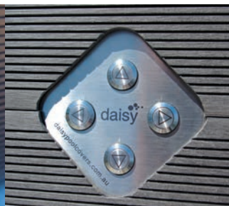
Operation by built in controls or via supplied remote fobs