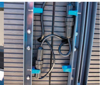
Units are linked electronically and locked mechanically